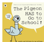
The Pigeon HAS to Go to School! Mo Willems 9781406389012 PB Classroom ideas available