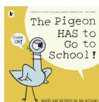
The Pigeon HAS to Go to School! Mo Willems 9781406389012 HB Classroom ideas available